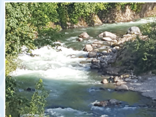
A view of the beautiful Sandy River.

While you’re in the area, you might want to take a short (1/2-mile) jaunt down to the left to Crown Point, to see the restored Vista House. Refill your water bottle there!