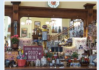
An interior shot of the Troutdale General Store. Stop on your way to the Columbia Gorge!