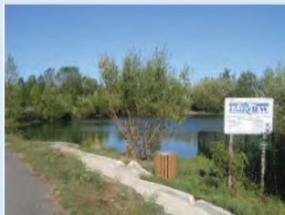
A view of the Salish Ponds Wetlands Park in Fairview. See rising fish and fishing herons here!