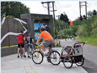
The Springwater Corridor trailhead at Gresham Main City Park.

Take a trip around Salish Ponds Wetland Park, then ride north to the Columbia River. Ride along the Marine Drive bike path to Blue Lake Park and through the surrounding neighborhoods. Return the same way.